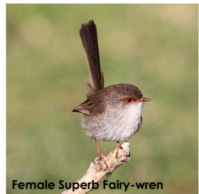
Female Superb Fairy-wren