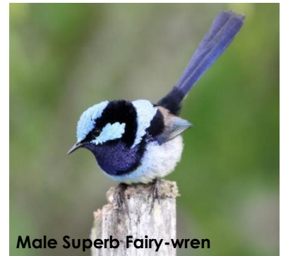
Male Superb Fairy-wren