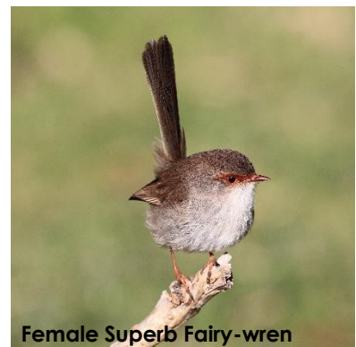
Female Superb Fairy-wren