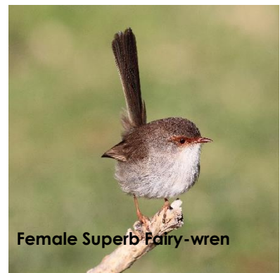
Female Superb Fairy-wren